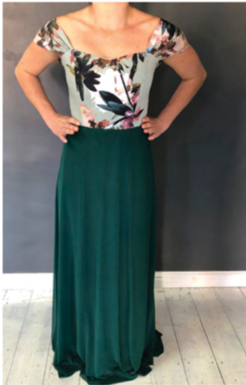
Fit - Flare cut