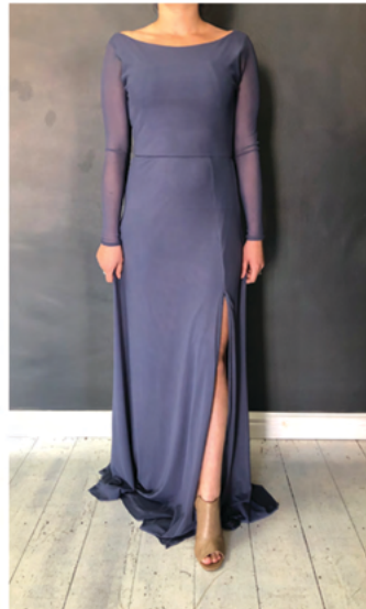
add a slit